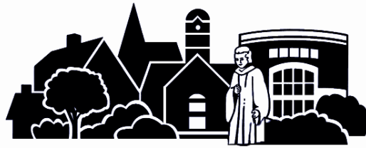
This is an edited version with no words or book

In 2009, the logo was cut in half when Blue Back Square came on board in 2007. The old town hall was now Fleming's and former Besito's restaurants. But in 2015, the Town Manager wanted the logo to return to its original full size, stating 'we are a community of homes and businesses.'