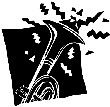
Celebrate! West Hartford