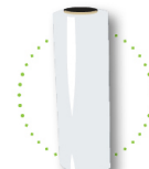
Pallet wrap & stretch film