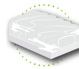
Wood pellet bags