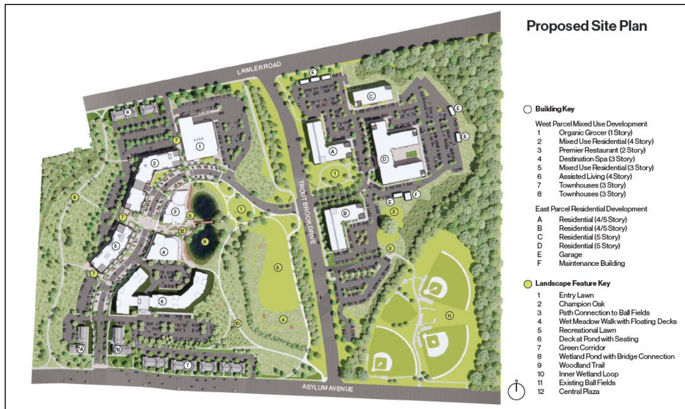
This is the latest proposed site plan, shared with West Hartford officials this month.